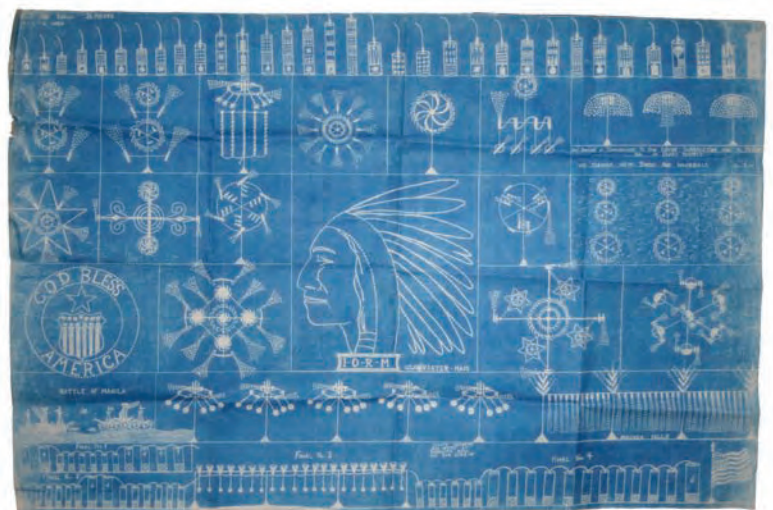
Blueprint for a firework display created for the Gloucester branch of the Improved Order of Red Men, c.1951. Gift of the Leominster Historical Society. [2014.008]