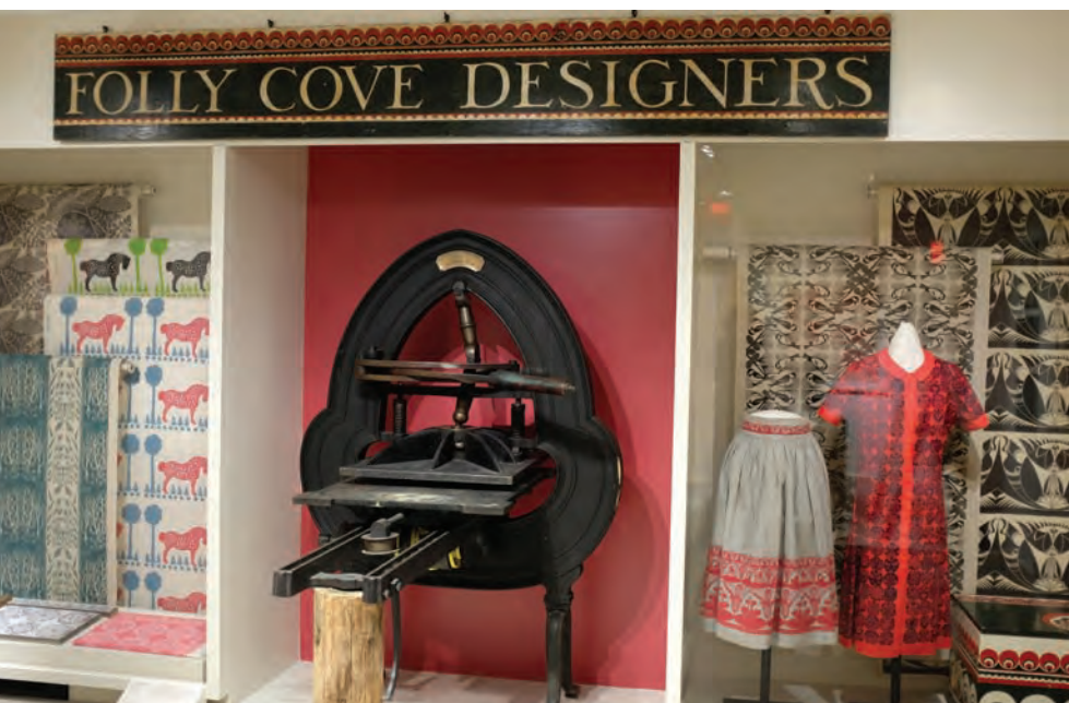
(left) Acorn Press and select fabrics in the new Folly Cove Designers Gallery; (above) Steel Derrick Quarry, c. 1914