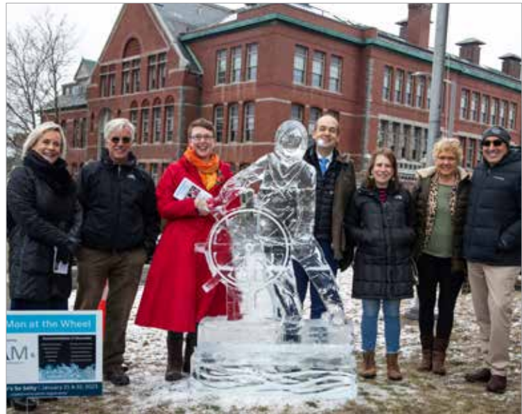
top: Students visit the wetu, created by local partner SmokeSignals, part of the ongoing installation Native Waters; Native Lands at CAM Green.